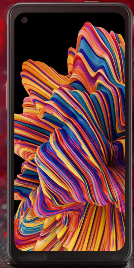
Samsung X Cover Pro